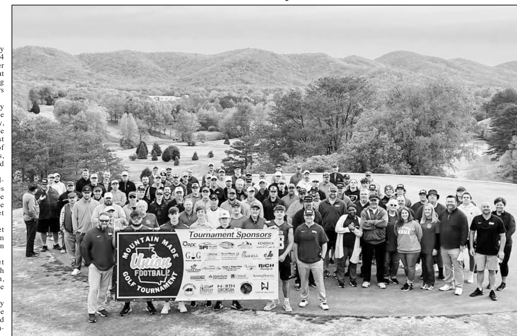
Union County football's 'Mountain Made' Golf Tournament at Butternut Creek Golf Course attracted almost 80 golfers to raise money for the program.