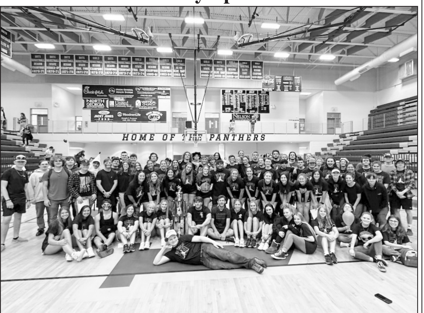
Union County High School's senior class held off a ferocious challenge from the sophomores to seize the coveted Class of the Year trophy during the annual Ulympics. The Class of 2025 took home first place in the Academic and Athletic competitions, but it wasn't enough to overtake the school's elder statesmen. Starting in 2007, the Ulympics are a year-long competition between each of the four classes at UCHS, culminating with an all-day athletic competition in May. Throughout the school year, classes are judged on participation in extracurricular activities, Grade Point Average, discipline referrals, attendance, athletics, school spirit and more.