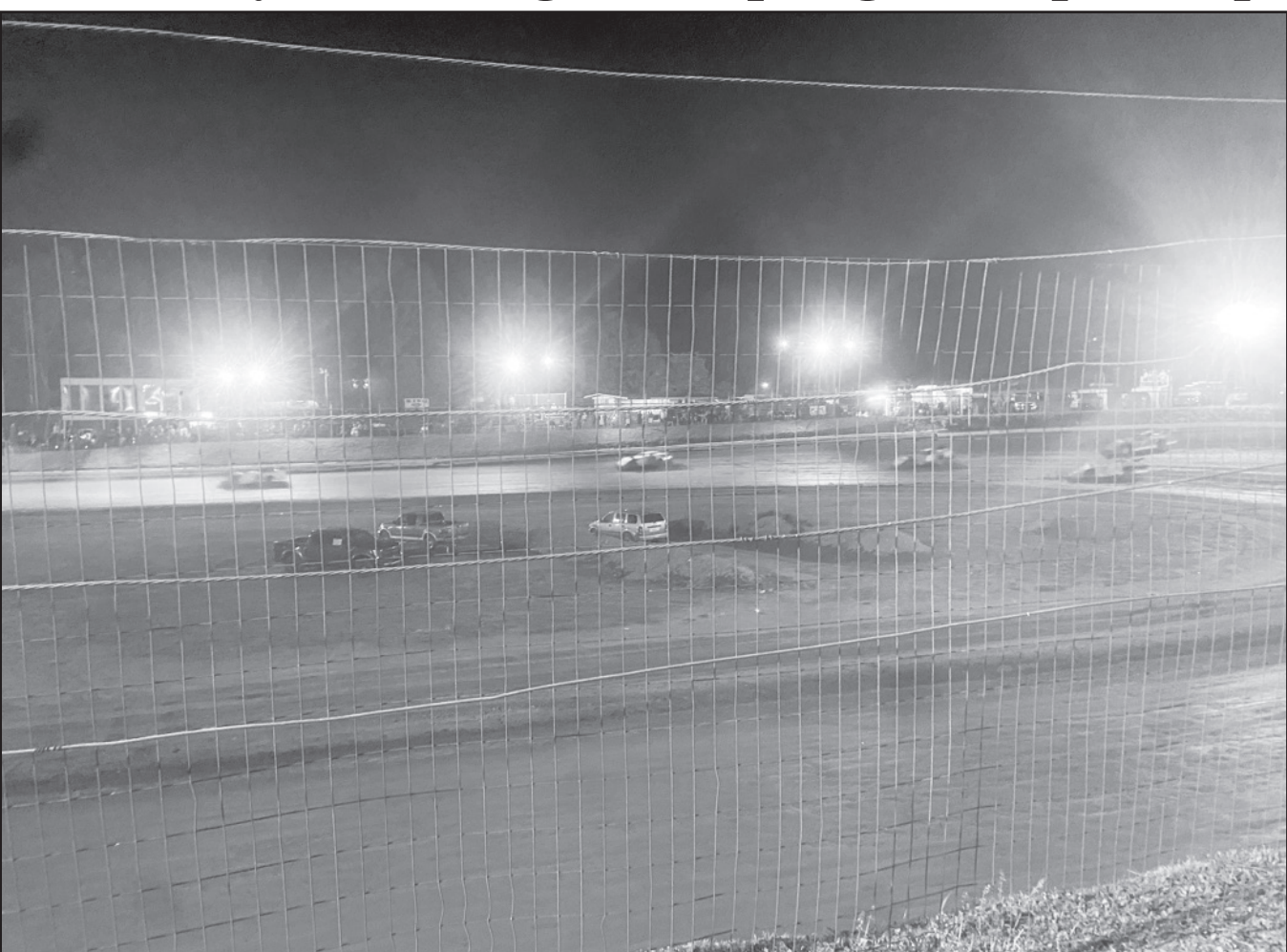
King Ford sponsored the Friday, May 19 Limited Late Models Spring Championship at Tri-County Racetrack, featuring a $1,500 top-prize during the evening's final race.